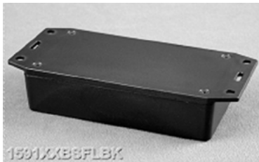
1591XX "S" FL